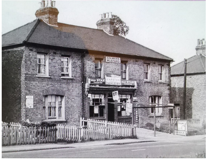
No 1 Larburnham Cottage, shop.

Compulsory Purchased by Basildon Development Corporation 1975