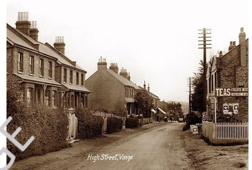
High Street, Vange