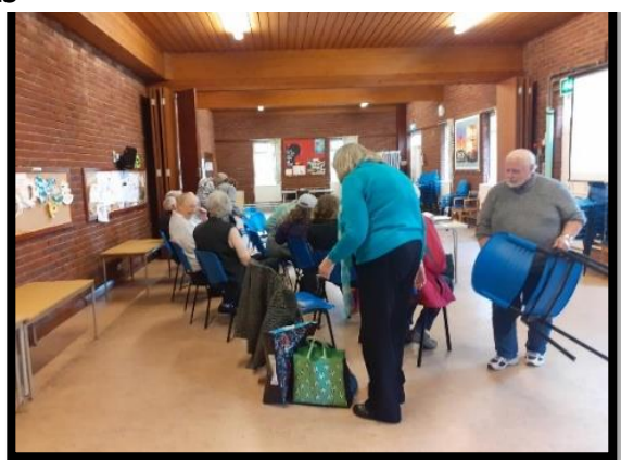
Animals at War - Talk

On the 18<sup>th</sup> April one of our volunteers gave a talk on 'Animals at War' to twenty plus members of the Christchurch Wickford Social Group.