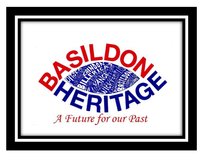
Proudly supported by Basildon Council