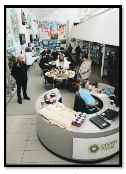
Open Day 6<sup>th</sup> April

On Saturday 6<sup>th</sup> April we held an open day in partnership with Basildon Council, Creative Basildon who were also able to supply a local Artist. We had 56 visitors and although the time given was 10.30am to 12.30pm, we still had people looking at displays and newspapers when we closed at 4pm.