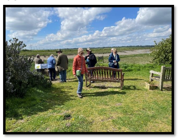
Hutton U3A on the walk

Monday 29<sup>th</sup> April the Hutton U3A group (15 members) joined us at the Green Centre to view our displays. We gave a short talk on the history of the park followed by a walk round the park before finishing up with light refreshments at the Green Centre.