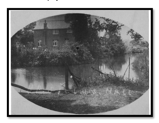
Basildon Hall pre-1914

Today, this site is registered as a Historical Scheduled Monument, reminding us of our rich heritage...Join us in unearthing and celebrating the vibrant history of Basildon".