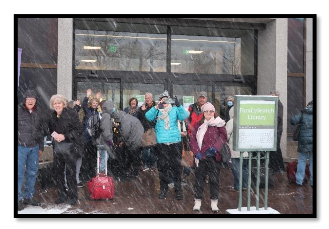
Ventura group waiting in the rain for their Family Library to open.