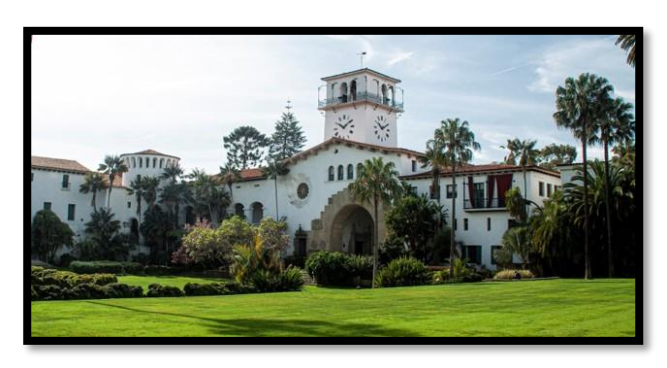
Santa Barbara – Court House

We continue to work with our friends in California, generally meeting by Zoom on a weekly basis both as group meetings and with individuals, helping with research into their family and social histories. Also, by sending copies of the various topic booklets and the borough community booklets of Basildon as well as copies of the lectures we have given here which also prove of great interest to them.