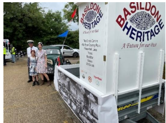
Our float with our volunteers dressed in 1950 outfits

We entered the parade for the second year – this year we had several of our volunteers dressed in 1950s outfits. The parade started from De La Salle school and ending in Northlands Park, where we had set up our display gazebo. The parade took over an hour and a half, but was well worth it. Weather held